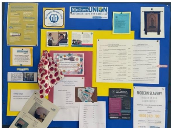
Tilehurst St Michael