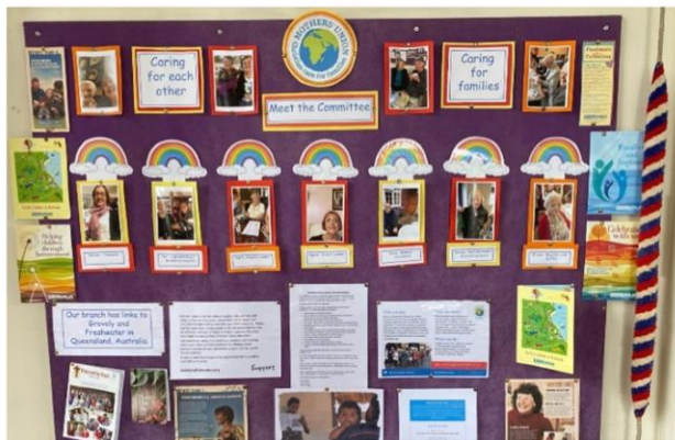
Earley St Nicolas